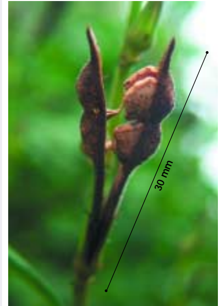
The seeds are released when the seed capsules dry out.

In tropical climates plant growth is probably continuous, especially in moist conditions or following rainfall.