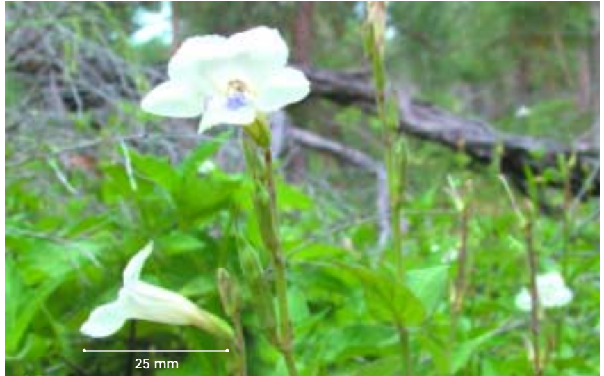
Infestations smother other ground vegetation: Anna Bay, north of Newcastle, NSW.

Maintaining groundcover and competitive desirable species is important, so get advice before spraying. Trials are being carried out by the NSW Department of Agriculture to identify suitable selective herbicides for A. gangetica ssp. micrantha . Work to date indicates that it is susceptible to a wide range of selective broadleaf herbicides (those that do not kill grasses).