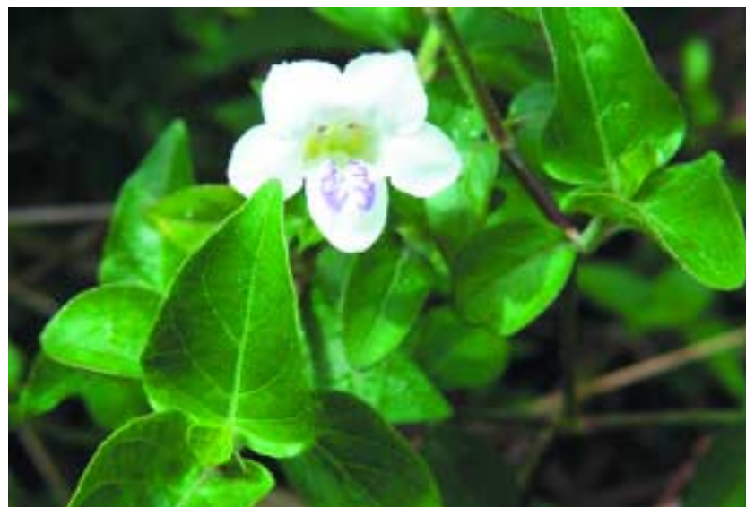
The two parallel purple stripes within the white flower are a distinctive feature of A. gangetica ssp. micrantha .

Both the leaves and the stems have scattered hairs. Occurring in opposite pairs, the leaves are oval, sometimes nearly triangular in shape, paler on the underside, and may be up to 25-165 mm long and 5-55 mm wide. White bell-shaped flowers, 20–25 mm long, have purple blotches in two parallel lines inside. The seed capsules are about 30 mm long, club-shaped (the neck is attached to the stem) and contain four flattened seeds held in place by conspicuous hooks.