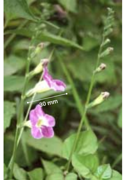
A. gangetica ssp. gangetica has purple flowers. It is naturalised across parts of northern Australia.

As with all weed management, prevention is better and more cost-effective than control. The annual cost of weeds to agriculture in Australia, in terms of decreased productivity and management costs, is conservatively estimated at $4 billion. Environmental impacts are also significant and lead to a loss of biodiversity. To limit escalation of these impacts, it is vital to prevent further introduction of new weed species, such as A. gangetica ssp. micrantha , into uninfested natural ecosystems.