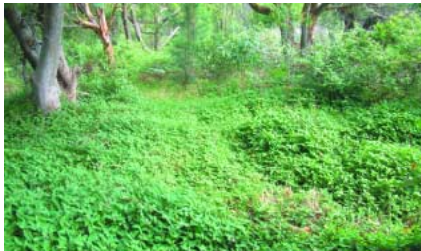
Most infestations north of Newcastle, NSW, occur on vacant residential land, along fencelines, and in abandoned flower beds and adjacent bushlands.

Both subspecies of A. gangetica are problem weeds throughout much of South-East Asia, including Malaysia, Indonesia, Papua New Guinea and the Pacific islands. They both grow widely as weeds in rubber, oil-palm, coffee and other crops, but A. gangetica ssp.