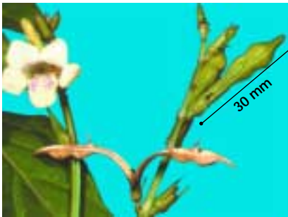
Flowers, leaves, and ripe and unripe seed capsules of A. gangetica ssp. micrantha .

The above contacts can offer advice on weed control in your state or territory. If using herbicides always read the label and follow instructions carefully. Particular care should be taken when using herbicides near waterways because rainfall running off the land into waterways can carry herbicides with it. Permits from state or territory Environment Protection Authorities may be required if herbicides are to be sprayed on riverbanks.